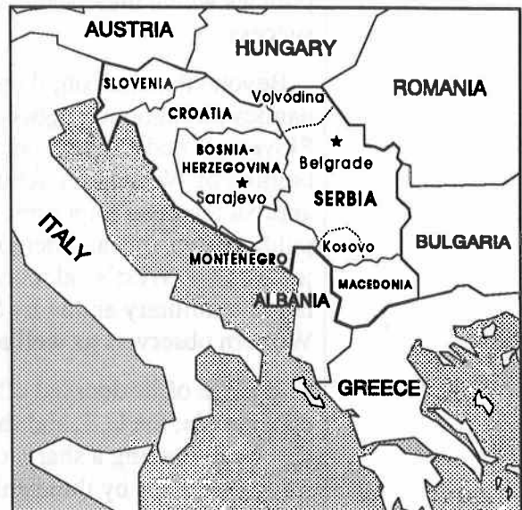
The New Borders of Former Yugoslavia

To some extent, Western policy makers may be motivated by a desire to send a warning to would-be aggressors. Unfortunately, the message already sent—and received—by the West's actions toward Yugoslavia over the past year is that Western threats and Western actions are separated by a wide gulf and that a determined and skillful aggressor can accomplish his goals if the planned offense is not too provocative.