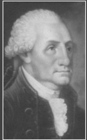
—George Washington November 2, 1783

“It is universally acknowledged that the enlarged prospect of happiness, opened by the confirmation of our Independence and Sovereignty, almost exceeds the power of description.”