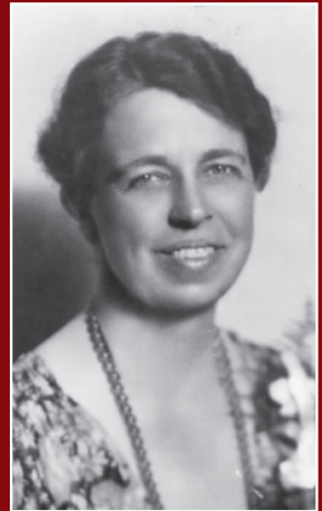
–Eleanor Roosevelt September 28, 1948

“Democracy, freedom, human rights have come to have a definite meaning ... which we must not allow any nation to so change that they are made synonymous with suppression and dictatorship.”