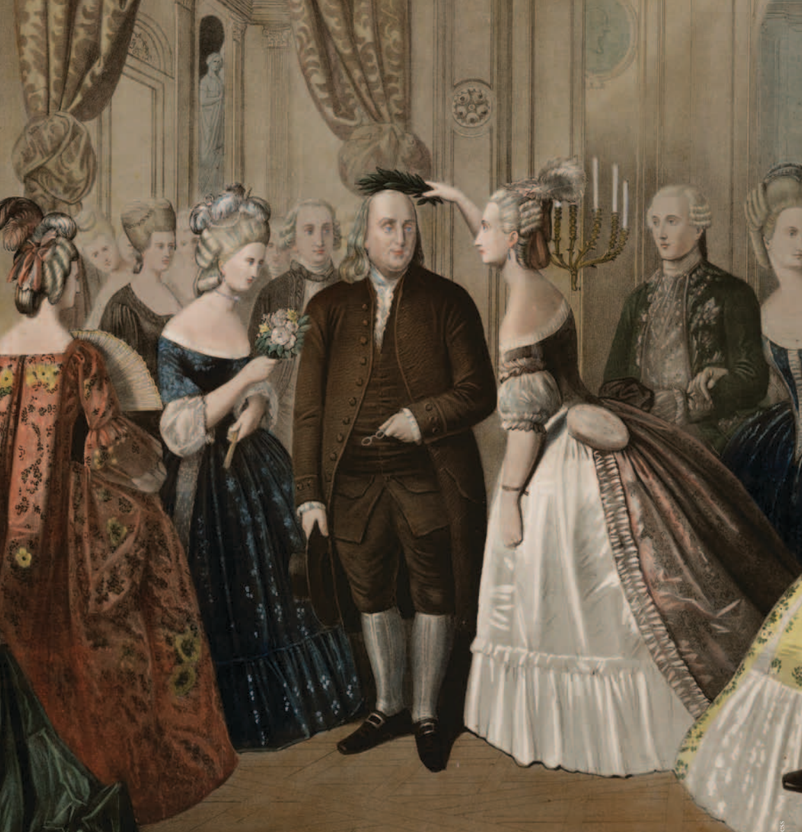
In 1778, Benjamin Franklin concluded negotiations with France for a Treaty of Alliance that helped the United States win the War of Independence.