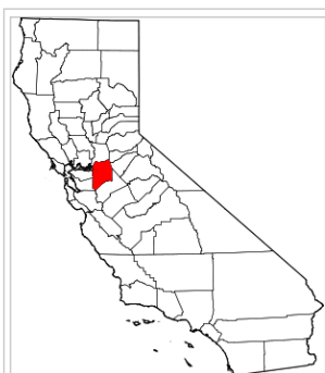
Manteca Unified School District is located in San Joaquin County, Calif.

See also: Manteca Unified School District, California