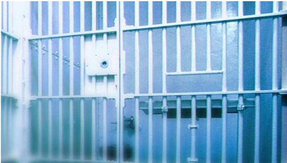
The man faces a two-year term in prison for ballot tampering.

MARCH 21, 2017 06:12 PM ,UPDATED MARCH 22, 2017 07:23 AM