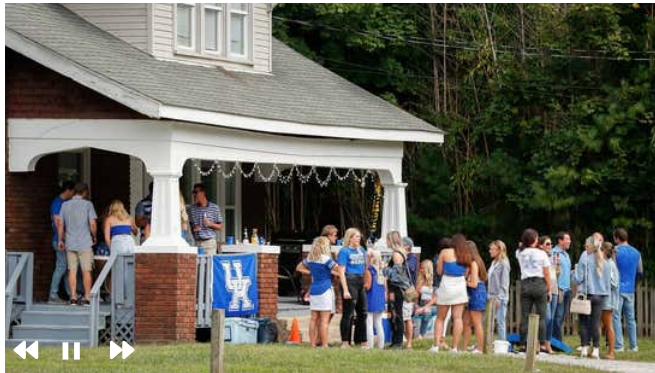
University of Kentucky, Lexington police will jointly patrol for student parties this weekend

Accompanying people into voting booths under the guise that they need assistance has been a common tactic in vote-buying in Kentucky.