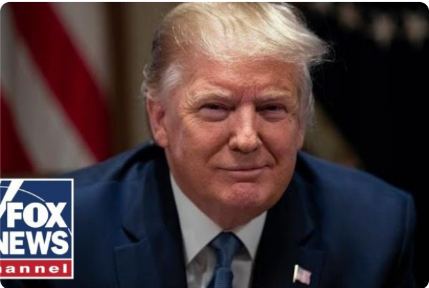
President Trump gives president debate reaction in 'Hannity' exclud... Revealing answers: Trump