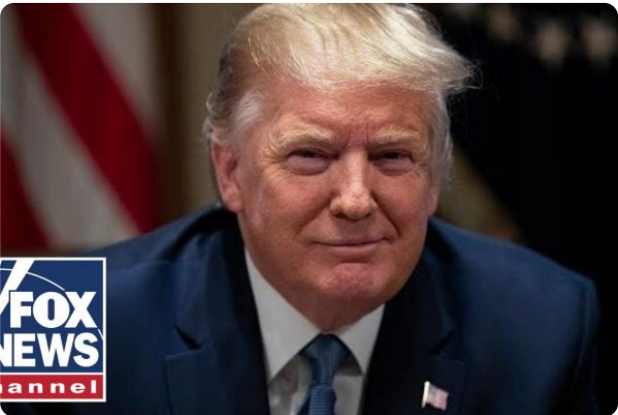
President Trump gives president debate reaction in 'Hannity' ex... Revealing answers Trump