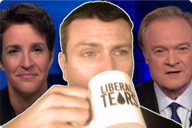
They're Not Getting Over It 🤔...