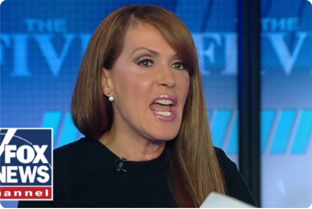
Dagen torches Cuomo for boasting about his pandemic response on 'The Five'...