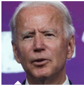
The One Line From Biden That Everyone Will Be Talking About