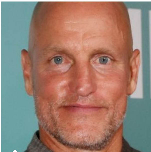
The Tragedy of Woody Harrelson Just Gets Sadder and Sadder