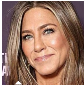
Jennifer Aniston Has a Message for Kanye Voters