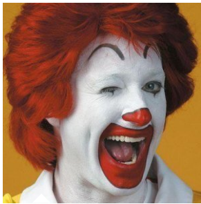
Why McDonald's Got Rid of Ronald McDonald is Out in the Open Now