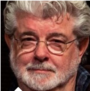
Unsettling Things Everyone Just Ignores About George Lucas