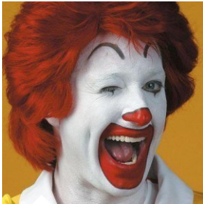
Why McDonald's Got Rid of Ronald McDonald is Out in the Open Now