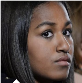
The Truth About the Obama's Youngest Daughter is Finally Out