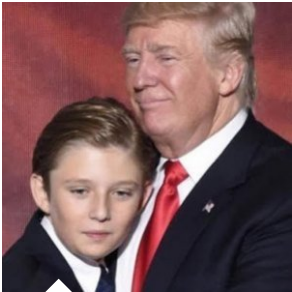
The Truth About Barron Trump Finally Revealed