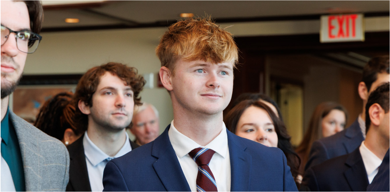
YLP INTERNS gather for graduation, celebrating their learning and growth throughout the semester at Heritage.