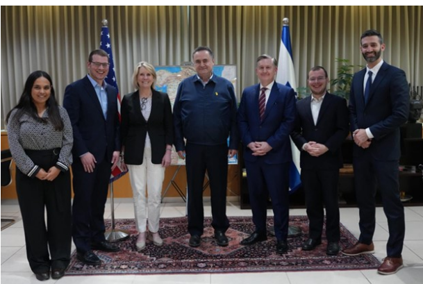
Heritage delegation meets Israeli Defense Minister, H.E. Israel Katz, and his team.