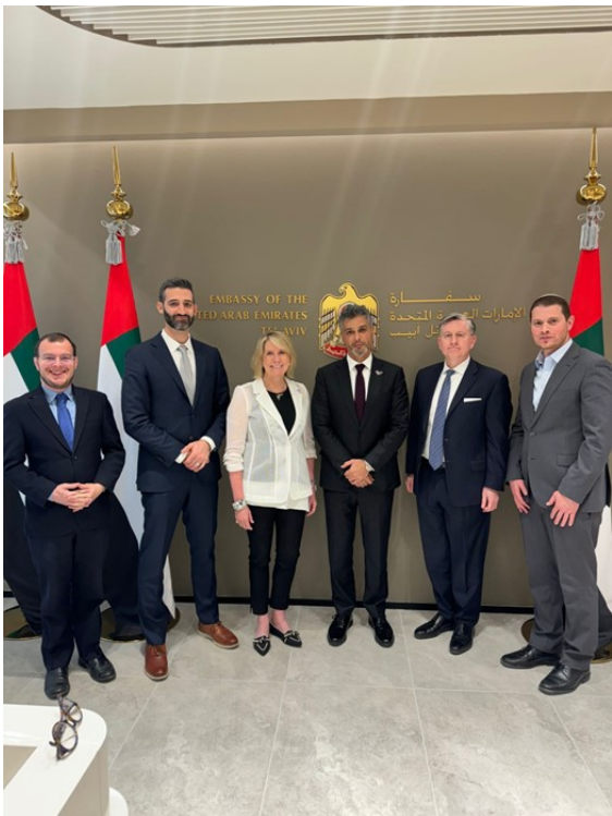
Heritage delegation meets the UAE Ambassador to Israel, H.E. Mohamed Al Khaja.