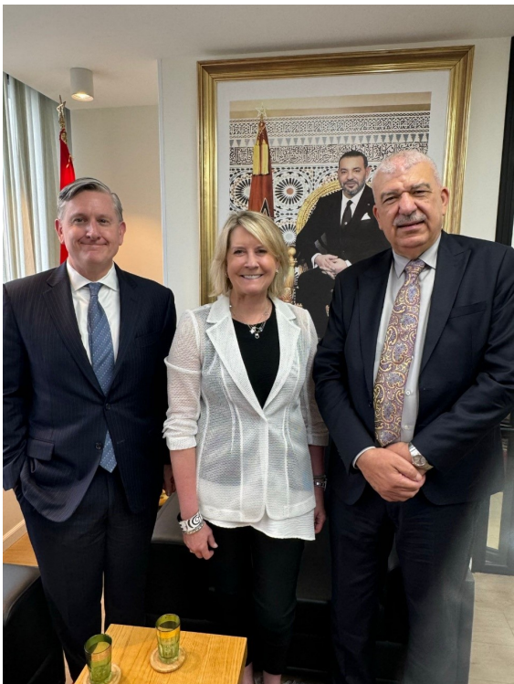
Dr. Victoria Coates and Robert Greenway meet with the Moroccan Head of Liason Office in Israel, H.E. Abderrahim Beyyoudh.

While in Israel, the Allison Center team met with Israel's Foreign Minister, Defense Minister, Strategic Affairs Minister, Members of Knesset, the American, Emirati and Moroccan ambassadors to Israel, and leading Israeli policy centers and experts. They also spoke at a leading national security conference in Jerusalem, alongside Israel's Prime Minister and other dignitaries, and engaged with local and international media.