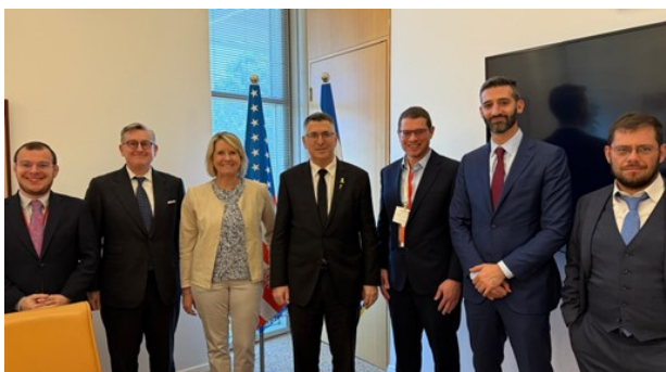
Heritage delegation meets Israeli Foreign Minister, H.E. Gideon Saar, and his team.