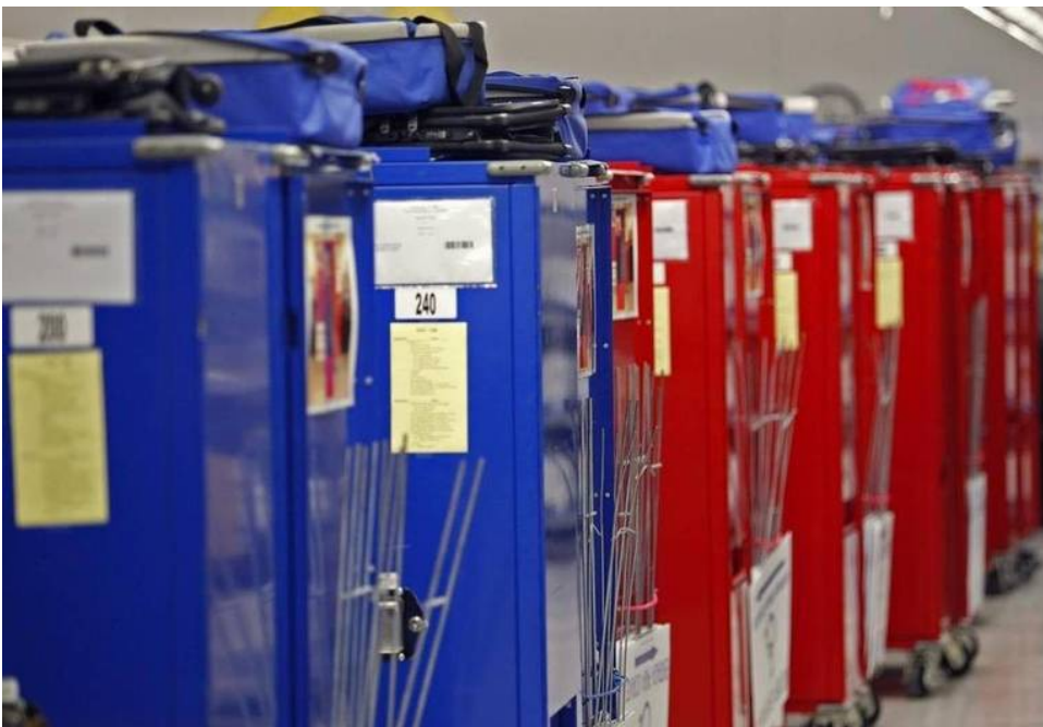
The state began investigation into possible voter fraud in Tarrant County less than a month before the Nov. 2016 election.